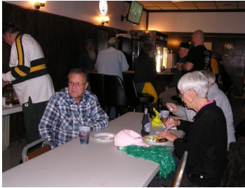
(Watching the game)