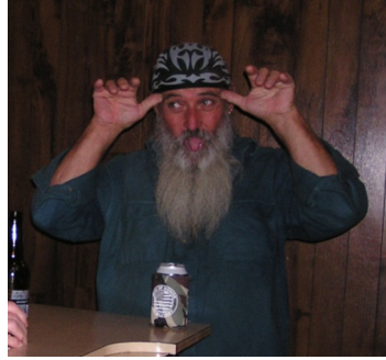
Is this our Prez?