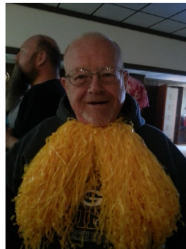
And our Secretary?

We'll see you at the Clubhouse for the Packer game!