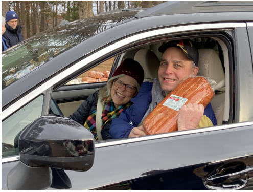
(Ham Giveaway from page 1, column 2)