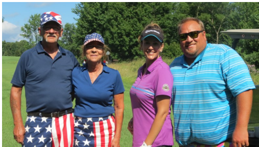
A Flight - Nowak

Mouse, Donald and I could see the smoke from the grills as we neared the clubhouse.