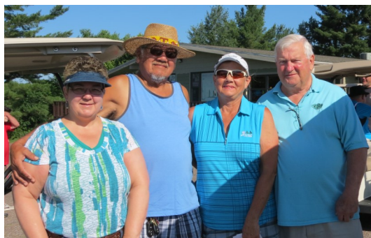
B Team - Callon Street Pub