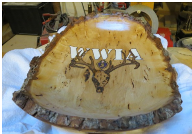
(A beautiful sample of work completed)