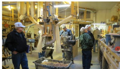
(MOH Members observe work being done)